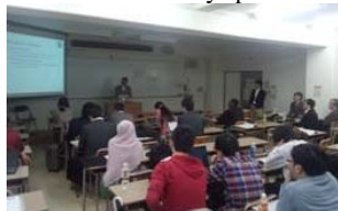
Fig.2 Session BS-1 provided by IEICE Technical Committee on Network Systems

Twenty to thirty General Conference participants joined at each Sub-Session. Every speaker and audience discussed and exchanged