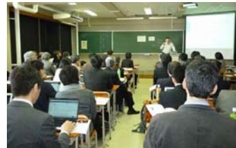
Fig.1 Participants listening to the presentation by the OSRs in the regular Session TK-5